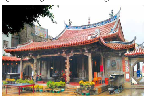
Tour 1: Taichung -Lukang -Tour of Lukang Street and monuments -Departure